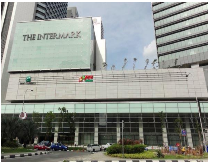
Front and Day view of THE INTERMARK Building