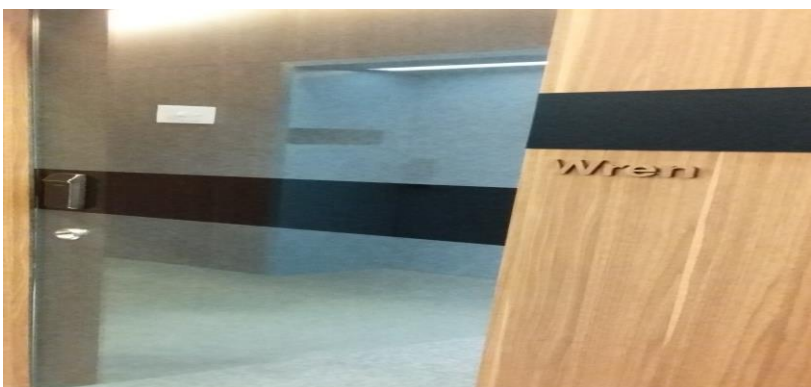
PREMIERE MALAYSIA OFFICE