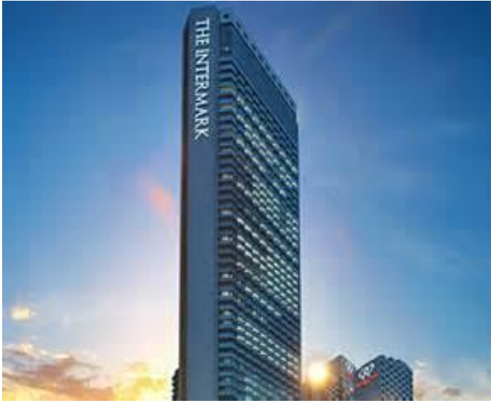
Premiere Malaysia Office is located in THE INTERMARK Building