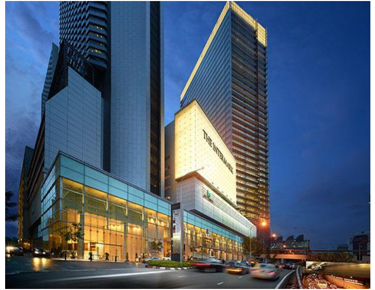
Night view of THE INTERMARK Building