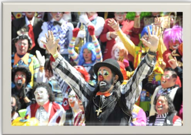
Clowns meet at Monumento de la Revolucion to celebrate the 21st International Clown Day on October 19, 2016 in Mexico City, Mexico