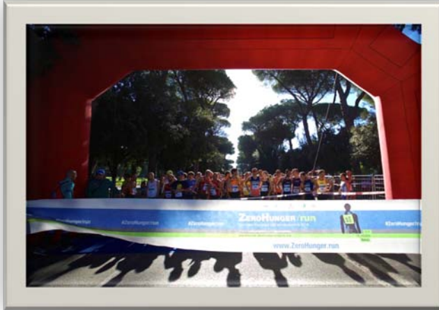
Participants set off during the "Zero Hunger Run" in Rome, capital of Italy, Oct 16, 2016. "Zero Hunger Run" was held in Rome on Sunday to mark the 36th World Food Day. The event recalls the commitment of 193 nations to the Sustainable Development Goals and their pledge to end hunger by 2030.