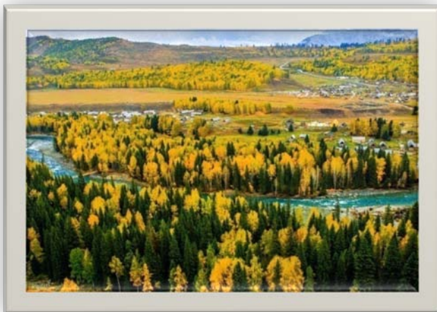
Altay prefecture is located in Northwest China's Xinjiang Uygur autonomous region. The Kanas National Geopark in the prefecture showcases the most beautiful scenery every fall.