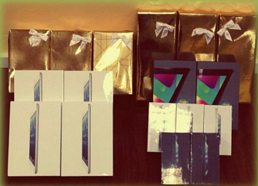
IPHONE, IPAD MINI, GOOGLE PAD, DIOR...