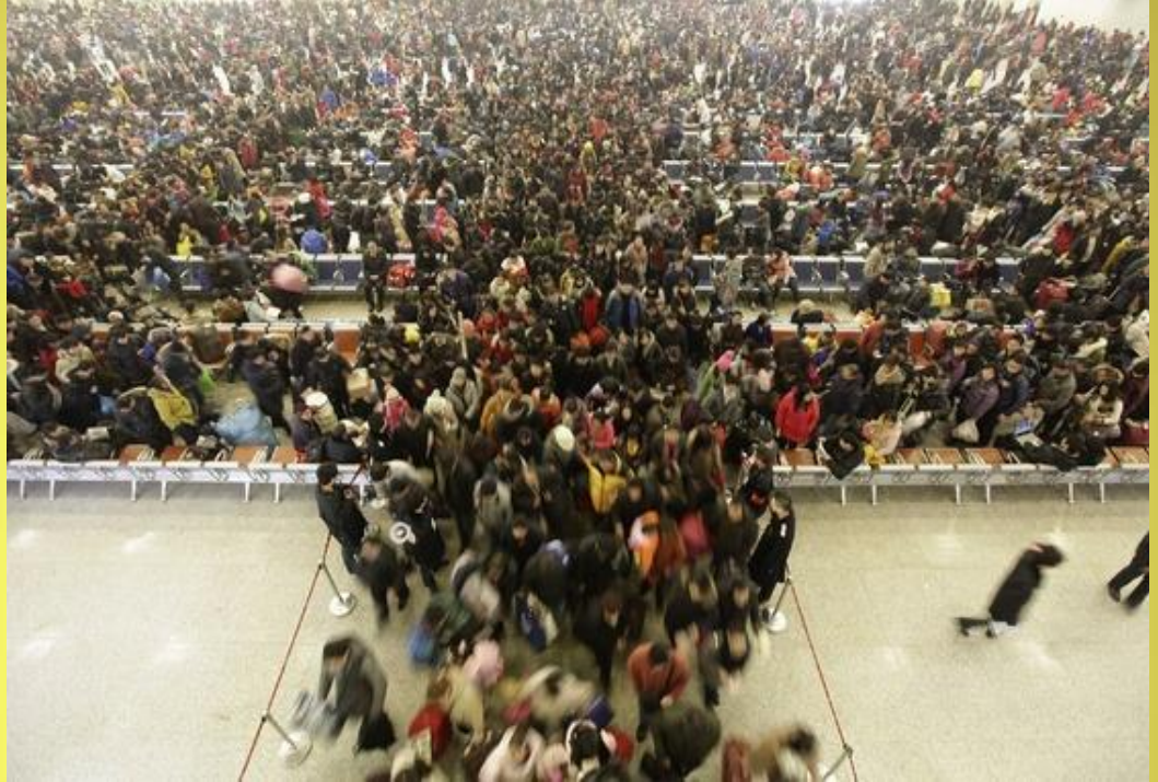
Chinese nationals boarding trains during the Golden Week

Known as "National Day," the commemoration kicks off that is called "Golden Week"